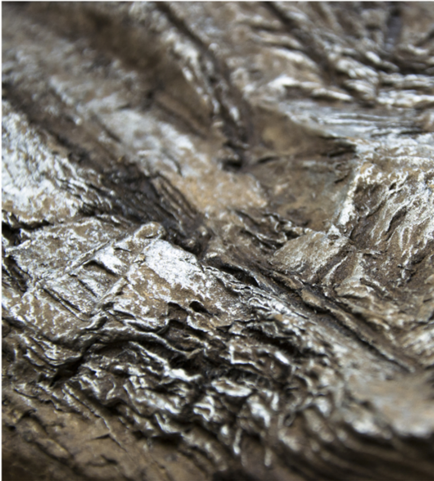
Material world — Earthen Wanderings

My work originates in a fascination with the unknown.